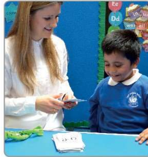
Learning the Speed Sounds in the classroom.